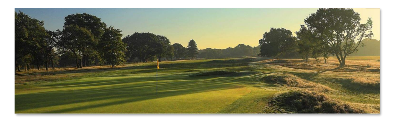
Lot 4 - A round and lunch for four people at Royal Wimbledon Guide Price: £500

A round for 4 people at Royal Wimbledon Golf Club on the date of your choosing to include complimentary lunch and wine. This members' only club (which you have all just hopefully enjoyed playing) is not accessible to the general public and has been recognised by Golfers Weekly as London's number one golf course.