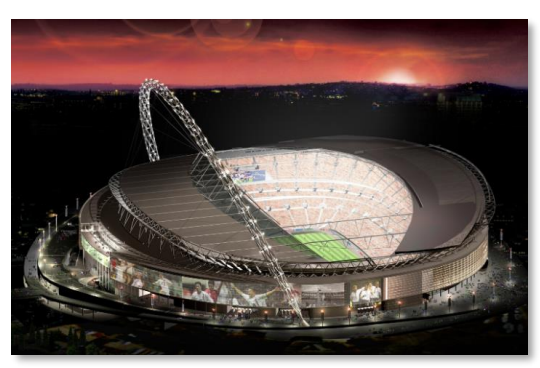
Lot 6 - Four tickets for an England game at Club Wembley Guide Price: £800

After a magnificent recent run tickets are hard to come by at the home of football.