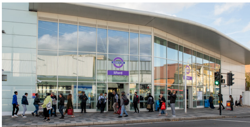
The new Crossrail station sits opposite the entrance to Exchange, Ilford