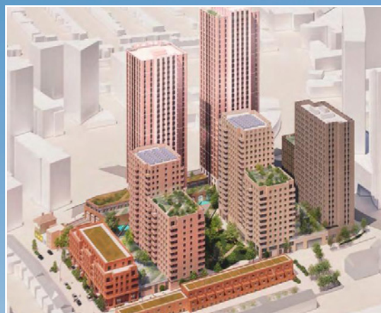
Chapel Place: Telford Homes and Sainsbury's submitted plans in summer 2022

The population is set to grow significantly over the next 10 years and Crossrail is hastening the movement of investment eastwards through London.