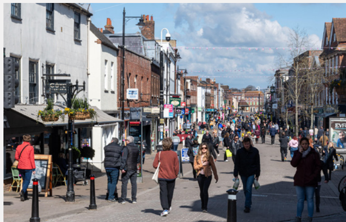
Parkway links with Northbrook Street forming the main shopping area

WELL CONNECTED: Newbury benefits from a prime position on the M4 corridor, providing a strong economic foundation for the town – and lies 20 miles west of Reading.