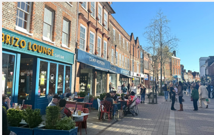
Parkway links with Northbrook Street forming the main shopping area

WELL CONNECTED: Newbury benefits from a prime position on the M4 corridor, providing a strong economic foundation for the town – and lies 20 miles west of Reading.