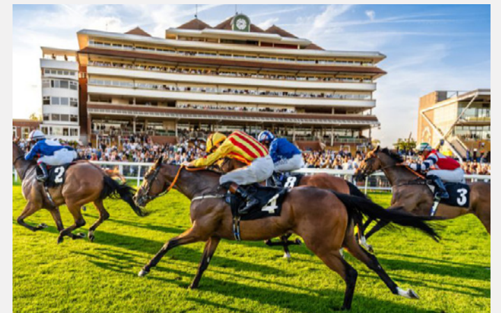
Newbury is ranked as a Top 10 racecourse in the UK